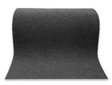
Indoor/ Outdoor Carpet (per sq. ft.) Astros Gray