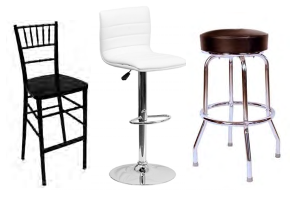
Chiavari, White, and Chrome/Black Bar Stools