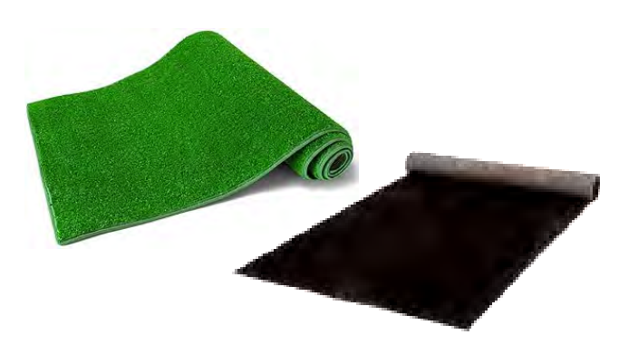
Astro Turf (per sq. ft.) Available in green and black