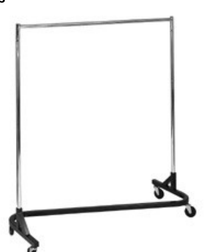
Coat Racks Hangers are also available

Available in white with chain and chrome with ropes